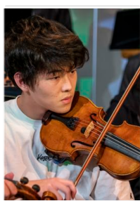
Sesshu Yamazaki College in Japan